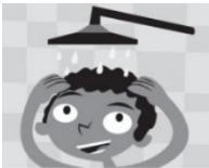
have a shower